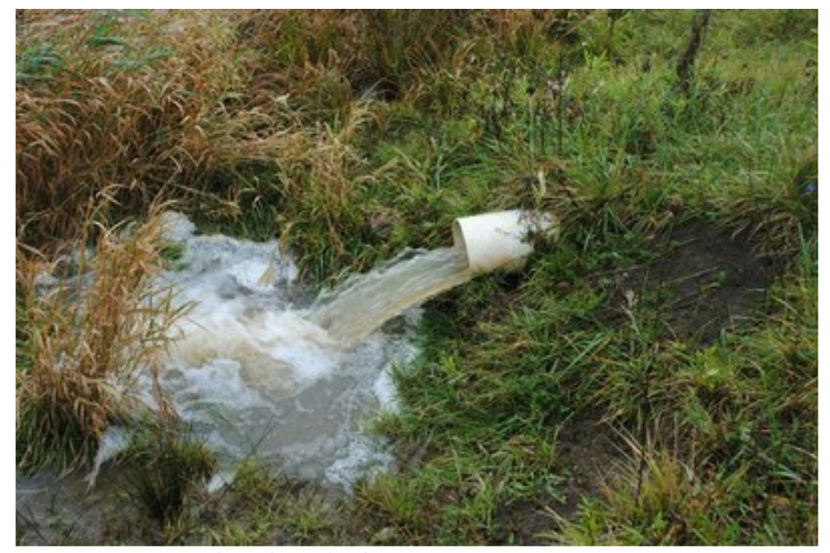
P Risk Index tile drainage

COLUMBUS, Ohio -- Grand Lake St. Marys has lost an estimated $60-80 million in tourism due to harmful algae blooms. And in 2011, algae blooms covered 990 square miles of Lake Erie's surface area, the largest in the lake's history. Phosphorus is the pollutant most often implicated in the degradation of Ohio's fresh surface water, with use of phosphorus fertilizer on farmland as a contributing factor.