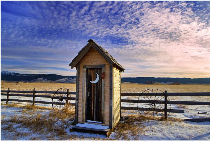
An outhouse near McCall, Idaho.

The Pew Research Center's excellent FactTank blog reported Tuesday that the Census Bureau is considering dropping a number of questions from its American Community Survey . The ACS has been a perennial target of Republican lawmakers , who say that its questions on everything from household income to commute times constitute an invasion of privacy.