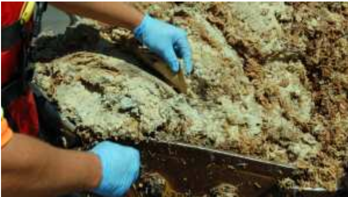
A thick layer of pulpy fibrous material like this sample above is suspended in the water at the Thunder Bay North Harbour site.

Markham-based Cole Engineering presented the options.