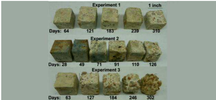
Photo of concrete cubes placed in sewage pipes

The current solution is to put plastic liners into the concrete pipes, a process that is almost as expensive as digging them up entirely. But if the problem is microbial, perhaps the solution is, too?