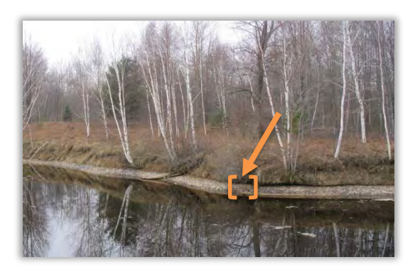
Figure 1 This picture shows where the character land is marked distinctly from the upland to denote the Ordinary High-Water Mark , below which is considered bottomland .

A permit is required to construct or maintain a pond when it is connected to or within 500 feet of an inland lake or stream. However, it should be noted that even if the pond is not within 500 feet of an inland lake or stream, construction or maintenance activities may require a permit under the Wetlands