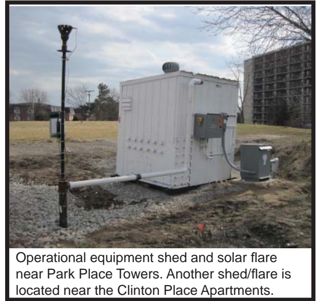
Operational equipment shed and solar flare near Park Place Towers. Another shed/flare is located near the Clinton Place Apartments.

Installation of the system was completed and started running in March 2012.