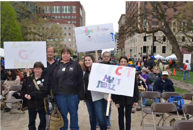
Baraga RICC holding signs at the Walk-A-Mile in My Shoes rally.

On May 14, advocates from across the state participated in the 10 th Annual Walk-a-Mile in My Shoes Rally. Michigan Association Community Mental Health Boards (MACMHB) hosted the walk in order to educate the public about mental health, substance abuse disorders and developmental disabilities, and to end the stigmas attached to them. Participants did a symbolic walk around the capitol and read statements to dispel stigmas. Many Regional Inclusive Community Coalitions (RICCs) attended and participated in the event and some were able to meet with their legislators to discuss their concerns.