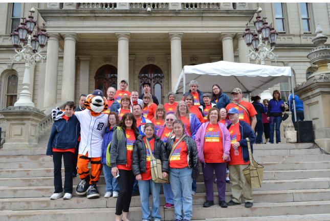
Northern Area RICC and CMH members taking a picture with Paws at 2014 Walk-A-Mile in My Shoes rally.