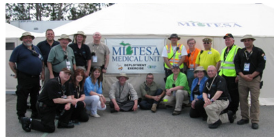
R2S Technical Support Team May 2014

by Region 2 South and the 25-40 bed hospital maintained by Region 5 were deployed to a Michigan region not affiliated with the state's MI-TESA program. Among the numerous objectives related to inter-regional deployment, the week-long event provided an opportunity for all eight Michigan Healthcare Coalitions to activate, deploy, and run field operations in the MI-TESA units with their mobile field teams comprised of volunteers from all medical and various non-medical disciplines. Volunteers with an interest in serving on a mobile field team are encouraged to contact their healthcare coalition for more information.