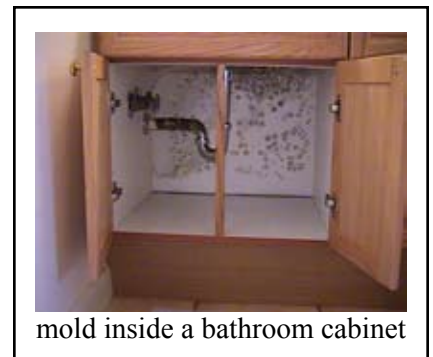
mold inside a bathroom cabinet