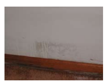
mold on a wall and carpet