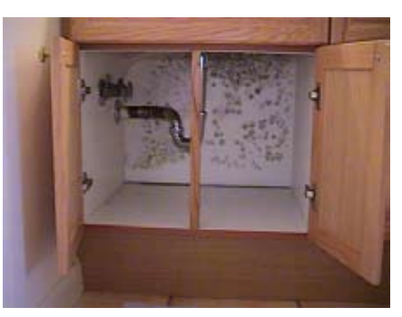
mold inside a cabinet