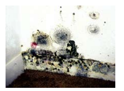
mold on a wall

Note that the State of Michigan does not license or certify companies for mold clean-up.