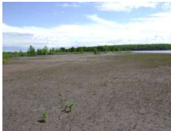
Figure 5: Expanse of exposed stampsand at Mason, picture taken 2008.