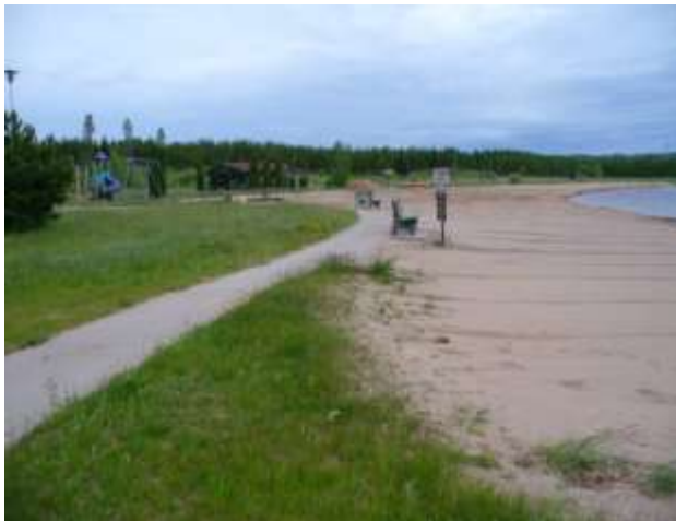
Figure 2: Beach area at the Lake Linden Village Park, picture taken July 2008.

c = The comparison value is the ATSDR chronic environmental media evaluation guide for a child.