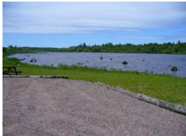
Figure 9: Calumet Lake and parking area, picture taken July 2008 (MDCH).