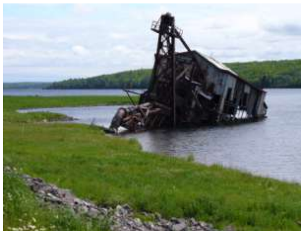
Figure 6: Partially sunken Calumet and Hecla/Quincy Reclaiming Sand Dredge at Mason, picture taken July 2008.

The Mason stampsands area includes structures from historical mining activities. In Torch Lake, just offshore is a sand dredge (Calumet and Hecla/Quincy Reclaiming Sand Dredge). See Figure 6. It is a state registered historical site (state registered historical site number P23275). Visitors and residents are allowed access to this location, and graffiti is on many visible areas and interior walls of the dredge (S. Baker, MDEQ, personal communication, 2012). Ruins of a building are present near the shore and are used for recreational activities, such as paintball (Figure 7). For further information on physical hazards present at this location and the Torch Lake Superfund site, please review the "Physical Hazards in the Torch Lake Superfund Site and Surrounding Area" public health assessment (ATSDR 2012).