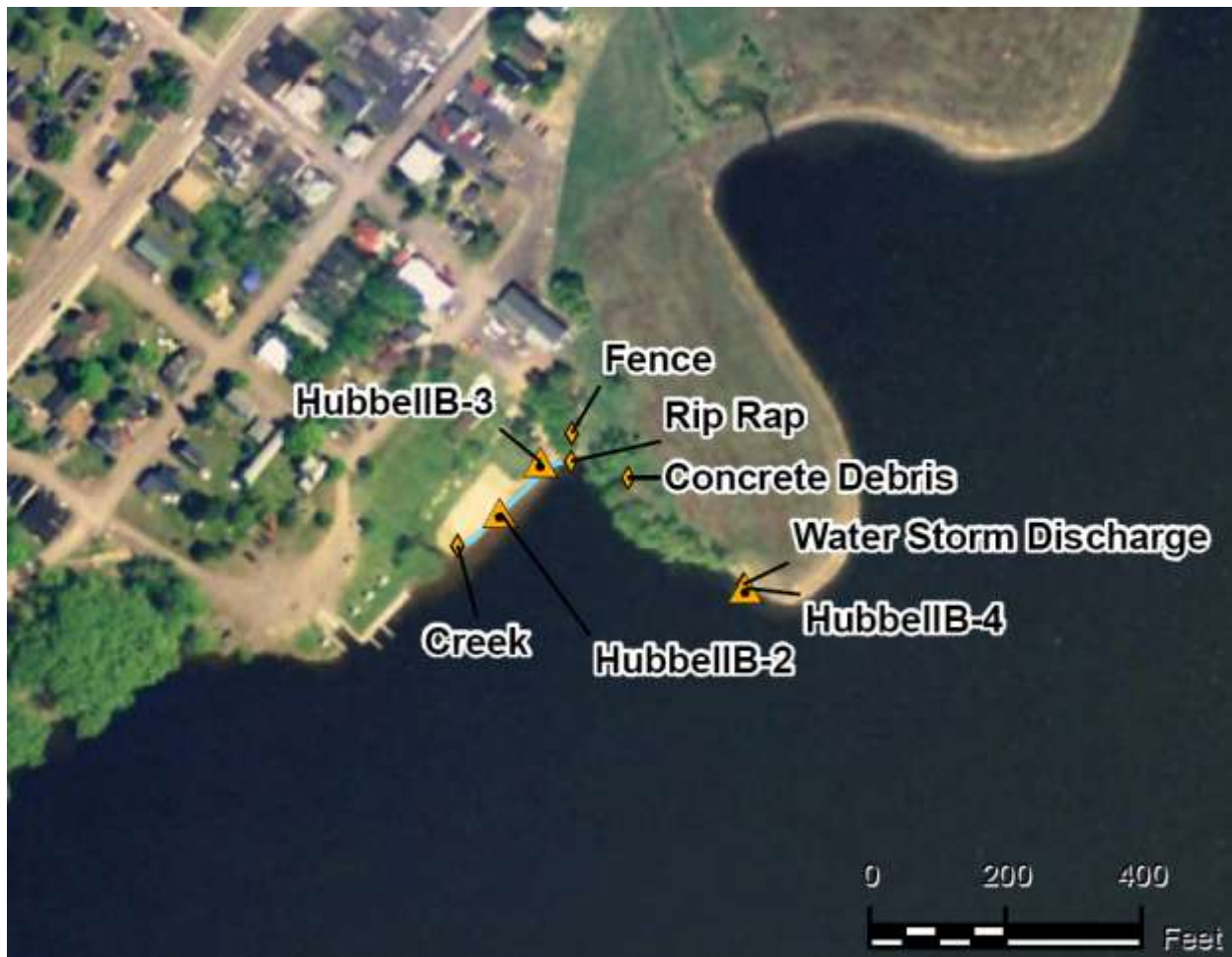
Figure D-2: Map of the Hubbell Beach and slag dump area (Weston 2007A). HubbellB-2, -3, and -4 are sample locations.