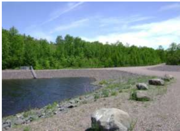
Figure 8: Boston Pond and driveway entry, picture taken July 2008.

Figure 8 shows a portion of Boston Pond and the access from the road, while Figure 9 shows the parking area for Calumet Lake. Table 6 presents the maximum levels of inorganic chemicals from both Boston Pond and Calumet Lake sampling over the site-specific screening levels or comparison values. (See Table C-6 in Appendix C for the full list of chemicals measured.)