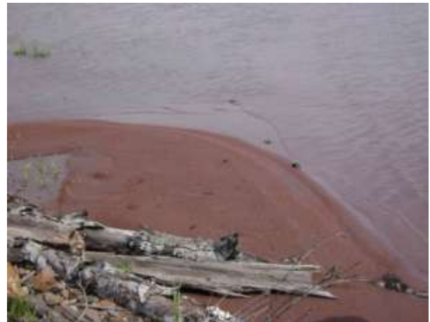
Figure 3: Stampsand along the shore of Torch Lake near the Lake Linden Village Park beach, picture taken July 2008