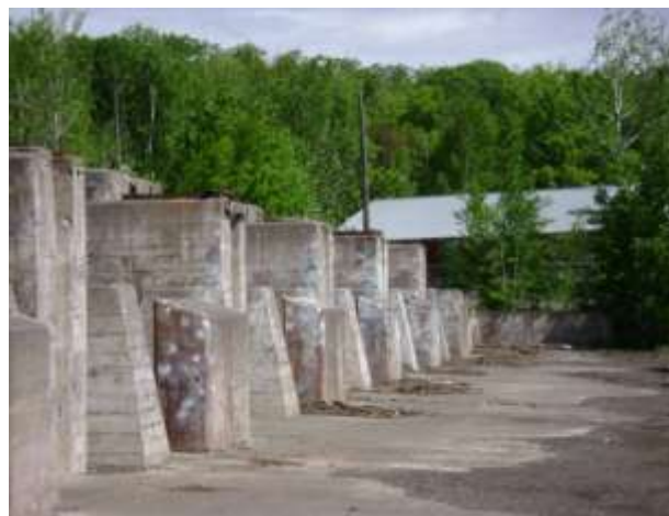
Figure 7: Ruins at Mason with paintball marks, picture taken July 2008 (MDCH).