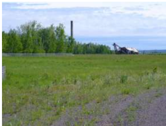
Figure 4: Expanse of partial vegetative cover toward the dredge at Mason, picture taken July 2008 (MDCH).

samples were sent to a laboratory for analysis. All seven of the samples were analyzed for PCBs. No PCBs were detected. Table 5 presents the maximum levels of inorganic chemicals without or over the site-specific screening levels or comparison values. (See Table C-5 in Appendix C for the full list of chemicals measured during this sampling.) Figure 4 and 5 are of the expanse of the stampsand at Mason. Locations included in this area were the Mason Area Ruins, Mason Sands, and Tamarack Sands.