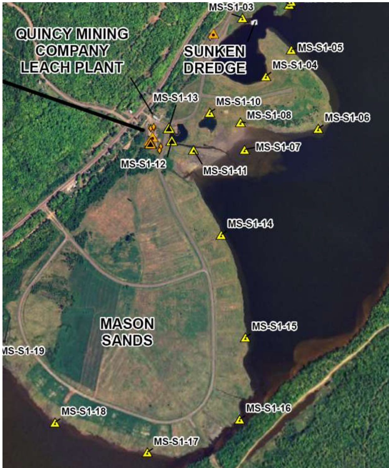
Figure D-3: Map of the Mason stampsands area (Weston 2007A). Triangles with MS-S1-XX are sample locations.