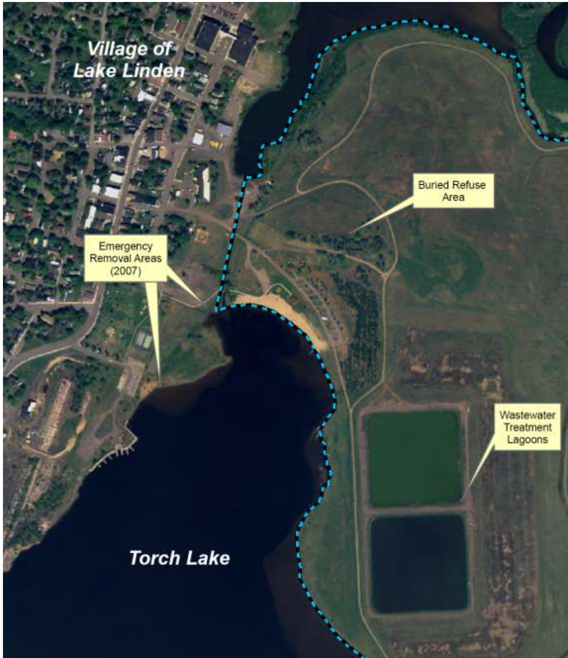
Figure D-1: Map of the Lake Linden area (MDEQ 2009A).

Appendix D: Additional maps of areas discussed in this document.