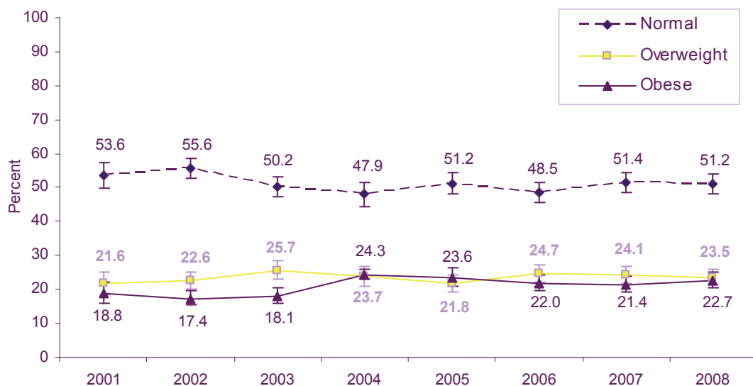
Figure 1: Trends of Pre-pregnancy Body Mass Index (BMI) Groups, MI PRAMS 2001-2008

However, pre-pregnancy obesity (BMI \geq 30.0 ) did show a general increasing trend from 2001 (18.8%) to 2008 (22.7%), and this rise was statistically significant (p-value for trend = 0.0005). ◇