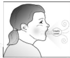
Sweet, fruity breath