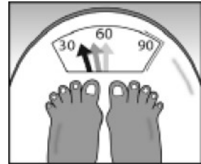
Unusual weight loss

If individual has labored breathing, weakness, is confused or unconscious, SEEK MEDICAL ASSISTANCE