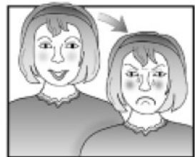
Mood/ behavior change