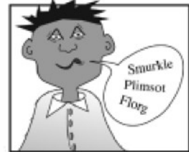
Slurred/ garbled speech

If individual is confused/unable to follow commands, unable to swallow, unable to awaken(unconscious), or is having a seizure or convulsion,