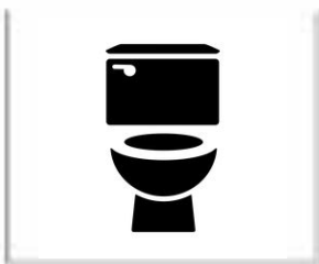
Frequent urination (bedwetting in children)

An individual may not always recognize symptoms of high blood glucose. These common symptoms, and others, may indicate high blood glucose.