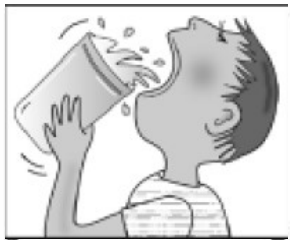
Extreme thirst/ dry mouth