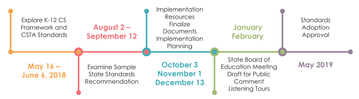
Figure 1. Timeline

The timeline allowed for broad stakeholder involvement and input in the standards adoption process. Public input was also sought during the review period from January 20 to March 6, 2019. The final draft was adopted by the Michigan State Board of Education in May 2019.