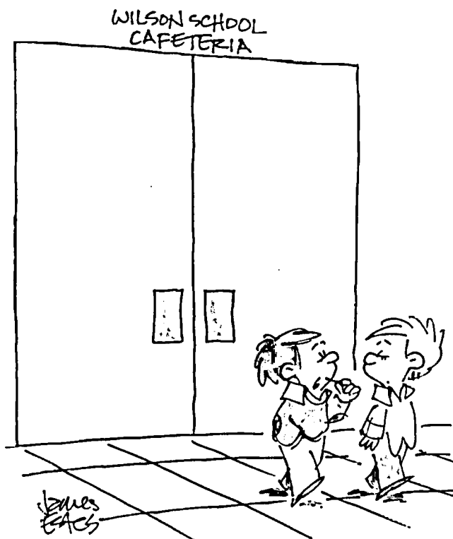
“The food’s really not half bad, but the atmosphere leaves a lot to be desired.”

• For primary teachers particularly, there is a tendency to emphasize quantity and presentation of work and to neglect its