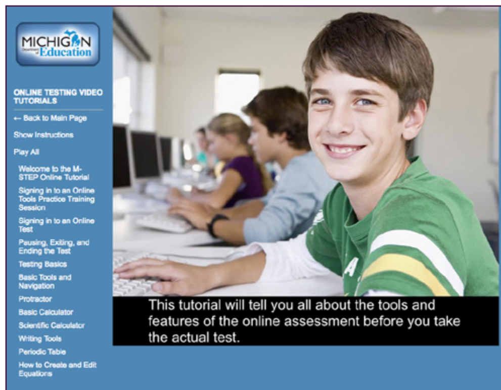
Figure 1 – Online Testing Video Tutorials