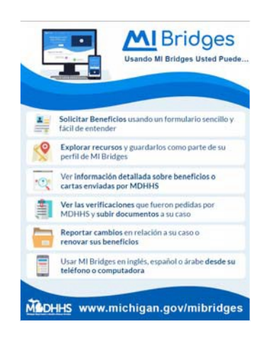
Figure 2: MI Bridges English. Arabic, and Spanish Fliers