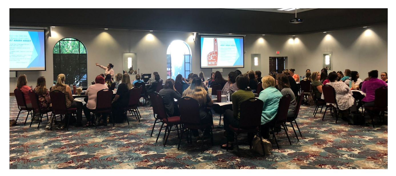
The Healthy Homes Coalition hosted a training for Head Start for teachers and visitors on how to identify homes with urgent lead hazards, make referrals, and provide initial education.

Worked with home visitors to promote awareness of lead hazards, conduct environmental screenings of homes for lead hazards, and connect families with services to reduce young children's exposure to lead