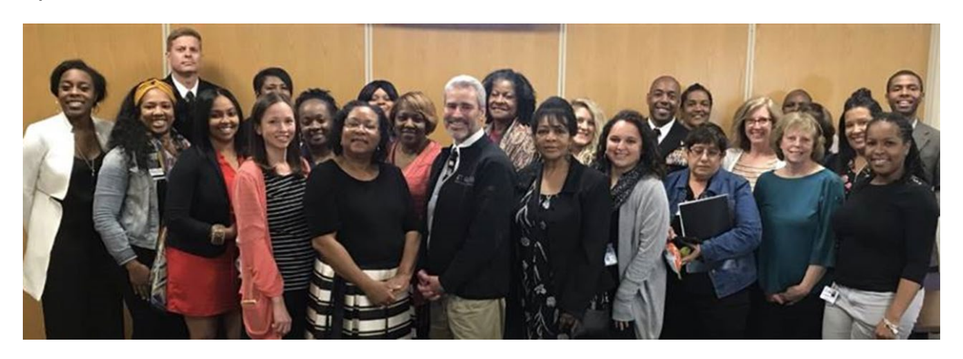
Participants from the Institute for Population Health's Preventing Lead Exposure During Pregnancy Conference funded by the CLEEC.

The Institute for Population Health piloted a project to screen pregnant women and infants under 3 years old using a Lead Risk Screening Tool. The tool was used to close the gap between what is known about screening and testing pregnant women for lead exposures that can be taken in advance to prevent lead exposure. Additionally, the screening inquired about the social determinants of health as risk factors for potential exposure or delayed follow up.