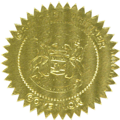
Gretchen Whitmer Governor

A handwritten signature in blue ink that reads "Gretchen Whitmer".