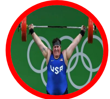
Little focus on individual talents, strengths and abilities