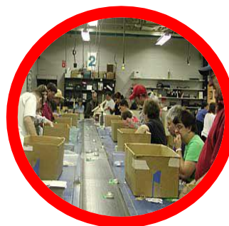
Facility based settings