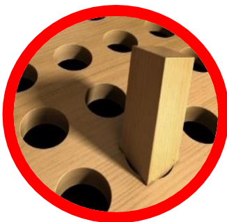
Fitting people into existing slots