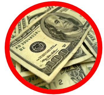
Making at, or above minimum wage