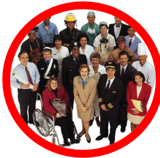
Alongside individuals without I/DD