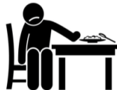
Loss of appetite