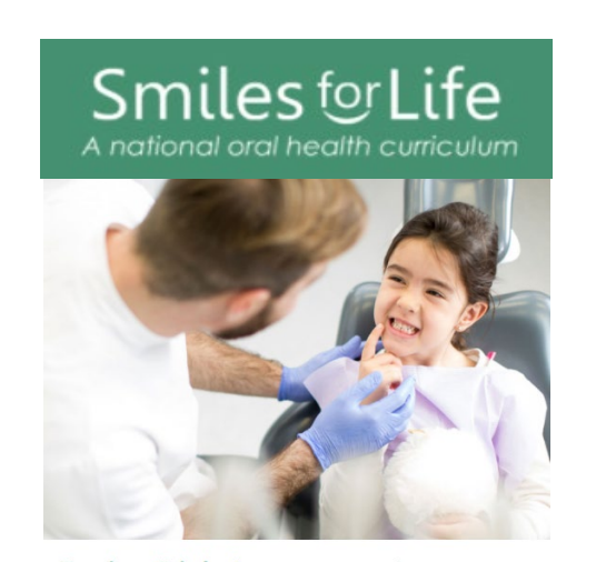
Caries Risk Assessment, Fluoride Varnish, and Counseling