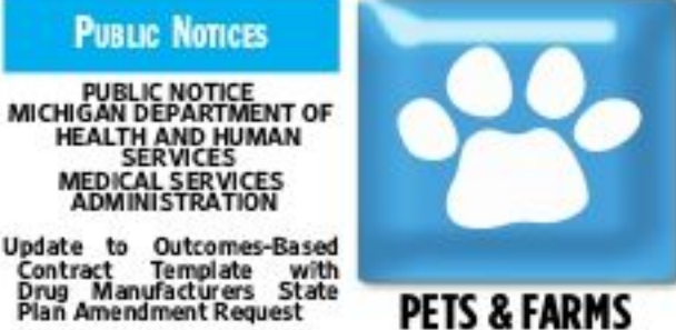
PETS & FARMS