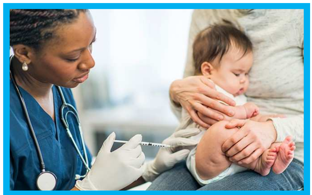
Credit: Foundation of Biomedical Research <a href="https://fbresearch.org/questioning-science-behind-vaccines/">https://fbresearch.org/questioning-science-behind-vaccines/</a>