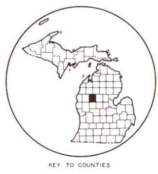
KEY TO COUNTIES