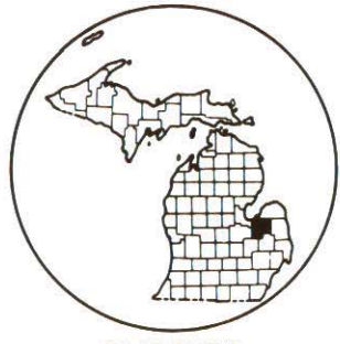
KEY TO COUNTIES