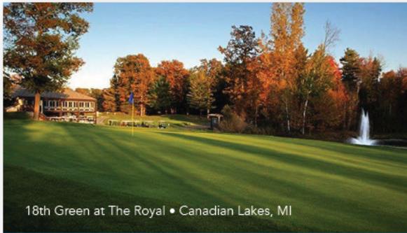
18th Green at The Royal • Canadian Lakes, MI