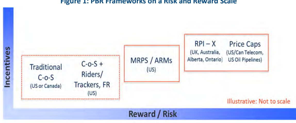
Figure 1: PBR Frameworks on a Risk and Reward Scale

Regulatory frameworks can be viewed in terms of their profile for risk and reward. That is, PBR type plans are structured so that utilities are provided an incentive to improve performance or realize outcomes. Providing a stronger incentive implies greater financial uncertainty in outcomes (for example, as the period between rate cases is lengthened, it is more likely that achieved returns will end up above or below the authorized level). However, the possibility for a loss also comes with the potential for reward—overall financial outcomes are more uncertain (i.e., riskier). The details of the specific components of a regulatory framework determine the level of risk and reward potential. We adopted a simple depiction of the range of PBR plan types and the associated levels of risk and reward in Figure 1 below.