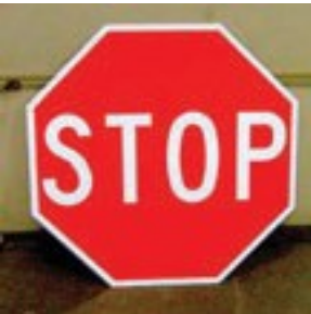
Conserve our natural resources by restoring old signage