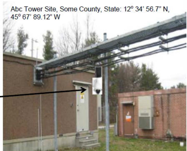
Figure 3. Ground-level photograph with graphic showing proposed equipment installation.

Ground-level photograph with excavation area close-up. The example in Figure 4 shows the proposed location for the concrete pad for a generator and the ground disturbance to connect the generator to the building's electrical service. This information can be illustrated with either an aerial or ground-level photograph, or both. This example has the name and physical address of the project site.