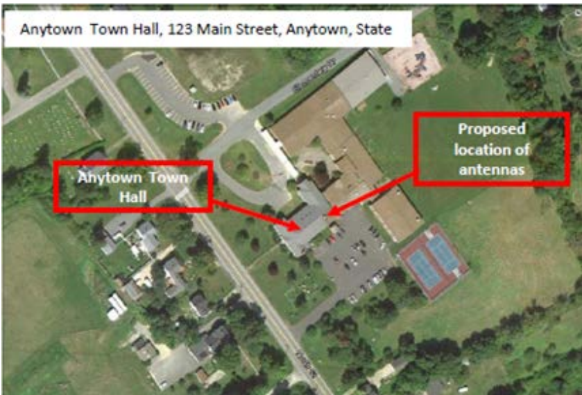
Figure 1. Example of labeled, color aerial photograph.

Aerial Photographs. The example in Figure 1 provides the name of the site, physical address and proposed location for installing new equipment. This example of a labeled aerial photograph provides good context of the surrounding area.