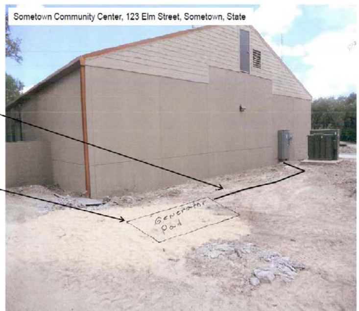
Figure 4. Ground-level photograph showing proposed ground disturbance area.