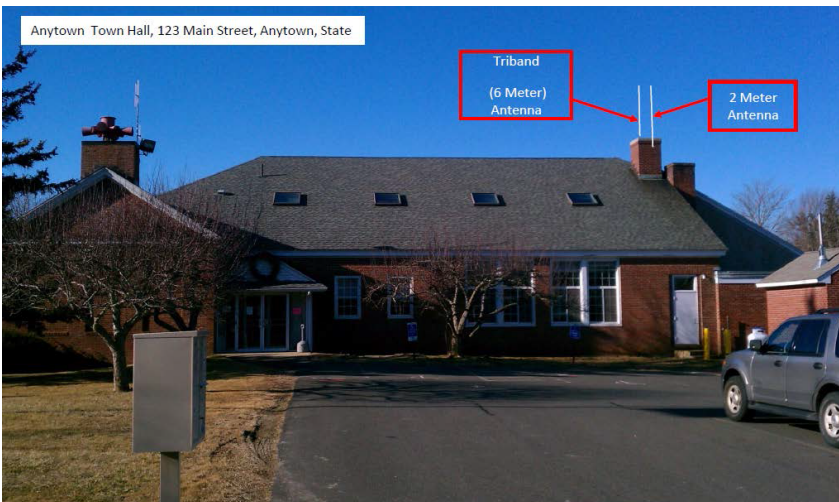
Figure 2. Example of ground-level photograph showing proposed attachment of new equipment.

Ground-level photographs. The ground-level photograph in Figure 2 supplements the aerial photograph in Figure 1, above. Combined, they provide a clear understanding of the scope of the project. This photograph has the name and address of the project site, and uses graphics to illustrate where equipment will be installed.