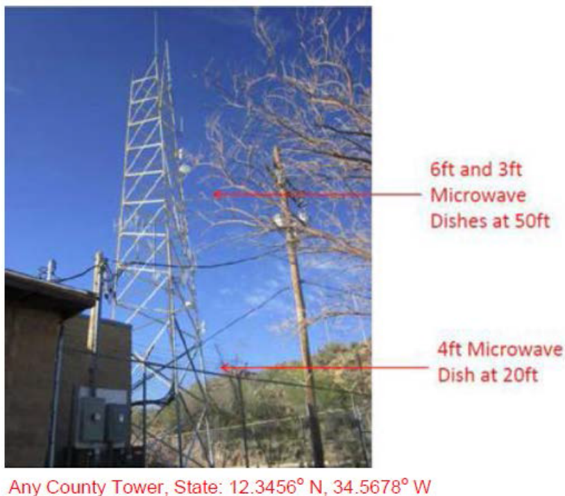
Figure 5. Ground-level photograph showing proposed locations of new communications equipment on an existing tower.

Communications equipment photographs. The example in Figure 5 supports a project involving installation of equipment on a tower. Key elements are identifying where equipment would be installed on the tower, name of the site and its location. This example provides site coordinates in decimal format.