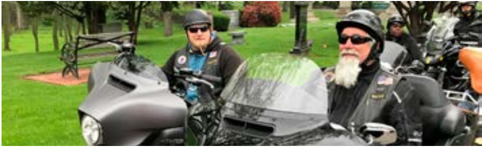
Area motorcyclists participated in the filming of the Fallen Brothers television commercial.

The awareness campaign is timed to coincide with the NHTSA's Click It or Ticket enforcement period.