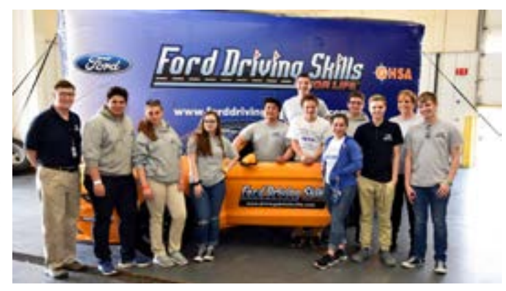
West Shore Educational Service District Career and Technical Education Center (Mason County) finished first in this year's Strive for a Safer Drive distracted driving and seat belt campaign.

Students from participating schools also attended a free hands-on driving clinic with professional driving instructors at the Ford Proving Grounds in Romeo on May 7.