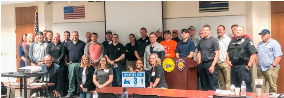
More than 30 people attended the May 16th training in Dearborn, MI.