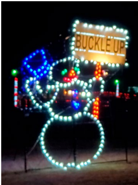
Linda Fech snapped this photo of Frosty reminding motorists to buckle up!