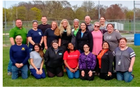
Fifteen new CPSTs were certified at an event in Grand Rapids in late April.