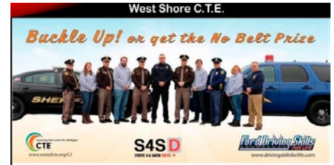
West Shore C.T.E.'s winning campaign slogan.

Students from participating schools can also attend a free, hands-on driving clinic with professional driving instructors at the Ford Proving Grounds in Romeo on May 6. For more information about S4SD, including how to enter for the 2019/2020 school year, go to: www.michigan.gov/s4sd .