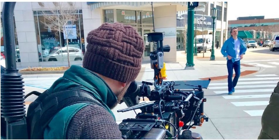
On May 17 in Birmingham, a new video was filmed to promote pedestrian safety. Pedestrian traffic fatalities dropped to 145 in 2018, from 158 in 2017. To view or share the video, go to Michigan.gov/walksafe .