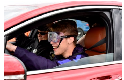
Nearly 200 students attended the Driving Skills for Life event.