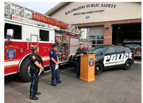
One of the stars of the A Ticket From Us video shoot (L) and a press event at the Kalamazoo Department of Public Safety (R) announcing the start of the campaign.