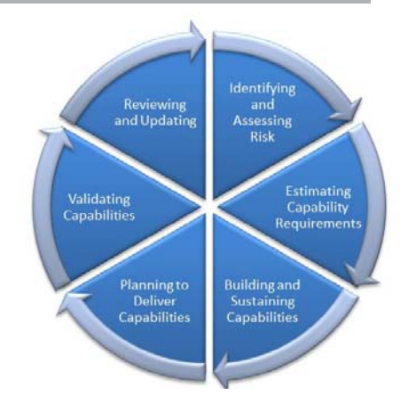
Figure 1: Mission Area Components of the National Preparedness System

Capabilities are the means to accomplish a mission, function, or objective based on the performance of related tasks, under specified conditions, to target levels of performance. The most essential of these capabilities are the core capabilities identified in the National Preparedness Goal. Complex and far-reaching threats and hazards require the whole community to integrate preparedness efforts in order to build, sustain, and deliver the core capabilities and achieve the desired outcomes identified in the National Preparedness Goal. The components of the National Preparedness System provide a consistent and reliable approach to support decision making, resource allocation, and measure progress toward these outcomes. The maturation and use of the National Incident Management System (NIMS) will aid in ensuring a unified approach across all mission areas as the National Preparedness System is implemented.