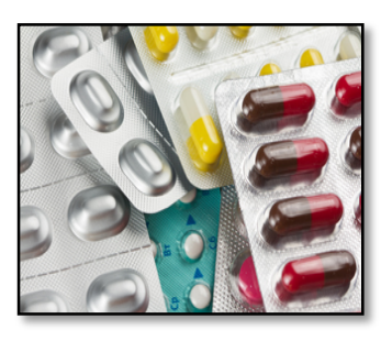
Chemicals and Pharmaceuticals