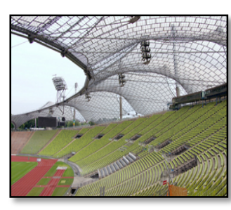
Building and Construction