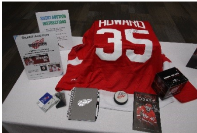
Silent Auction: Item Value $300+