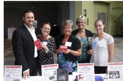
Red Fishbowl Raffle: Item Value up to $150