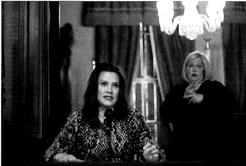
Michigan Gov. Gretchen Whitmer gives her morning coronavirus pandemic address via livestream on Monday, April 13, 2020.

Michigan Citizens for Fiscal Responsibility, a Lansing-based organization with ties to Senate Republicans, gave $660,200 to Unlock Michigan from June 9 through July 20, according to a new campaign finance report. Unlock Michigan is the ballot committee that wants to repeal a 1945 law that allows the governor to declare a state of emergency and keep the declaration in place without input or approval from the Legislature.