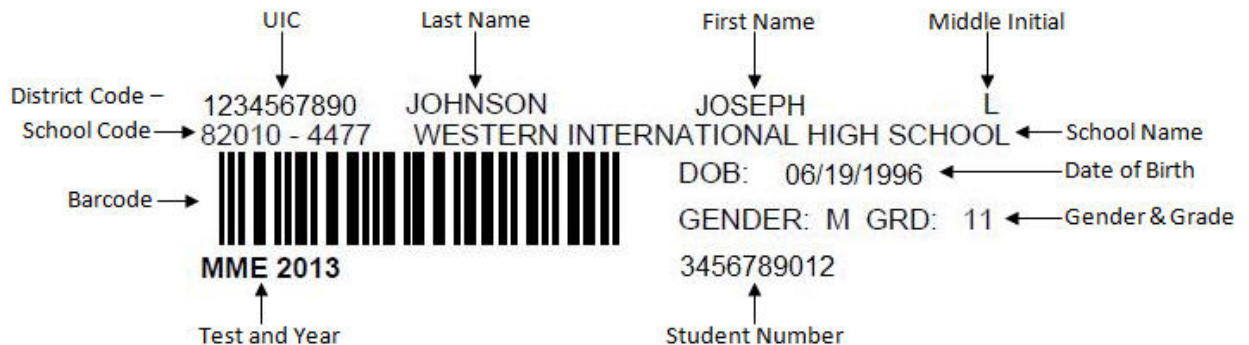
Diagram 1.1 Sample Barcode Label

All barcodes for use on student answer documents are printed as machine-scannable Interleaved 2 of 5 (I2of5) or Free 3 of 9 Extended Regular (Fre3of9x) barcode numbers and also as 10-digit human-readable barcode text in 8.5 point Arial font. The barcodes are approximately 1 5/8” wide and 3/8” high. The student barcode supplied by DAS is 10 digits in length and includes a check digit that is calculated by DAS.