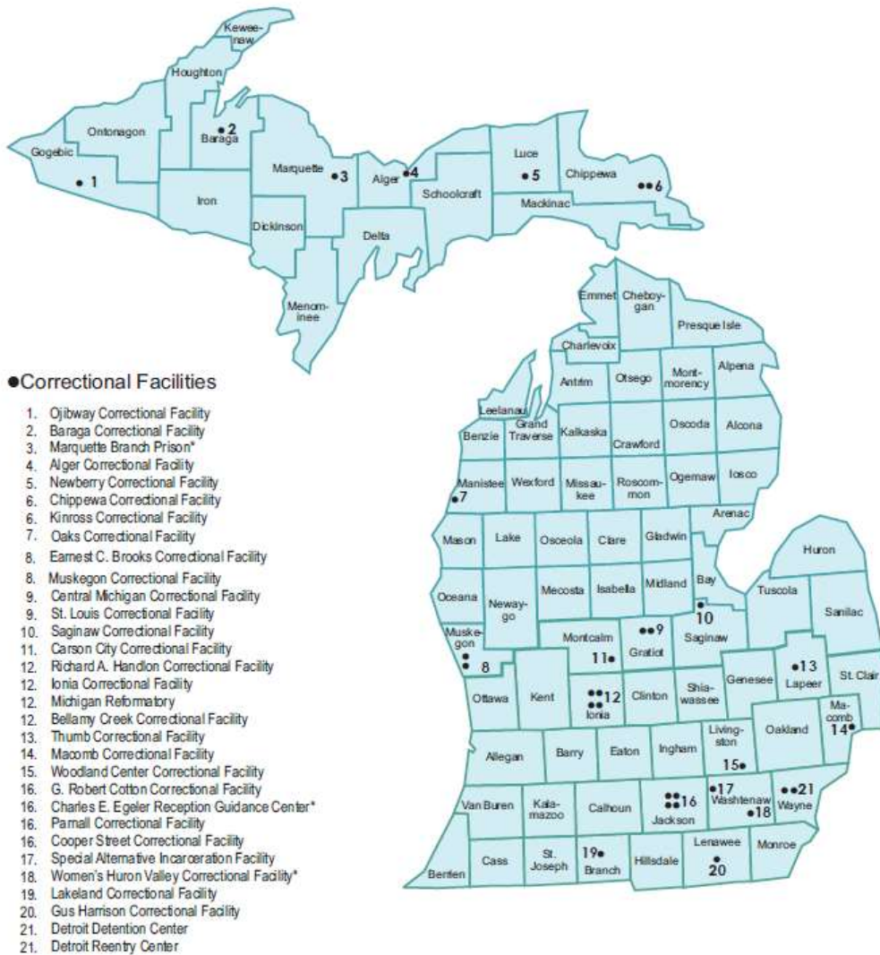
Michigan Department of Corrections Correctional Facilities Map As of May 1, 2018

This map is offered as a visual representation of the locations of the MDOC facilities, this map was issued in January of 2017 and, due to closures and consolidations and additions, this map may not be 100% accurate at this posting.