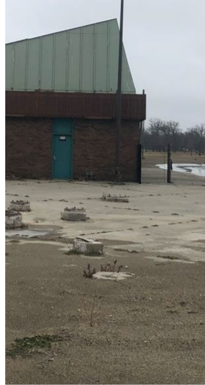
Belle Isle Park Beach House