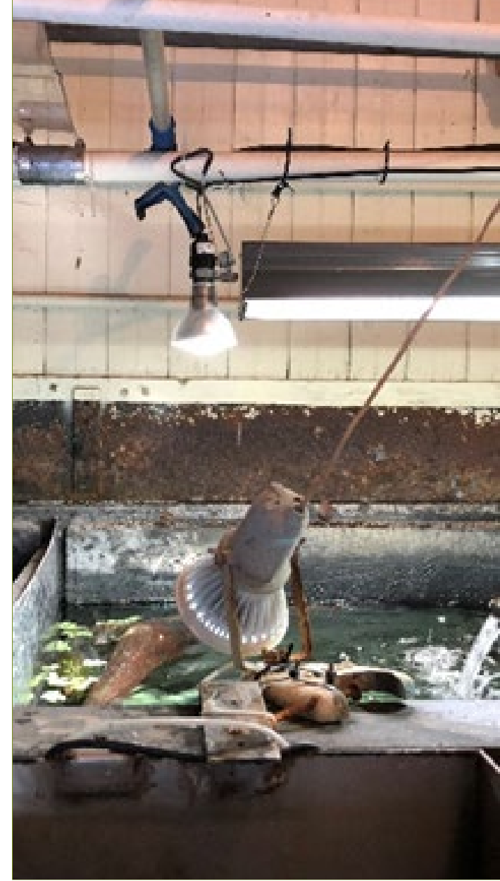
Anna Scripps Whitcomb Conservatory & Belle Isle Aquarium