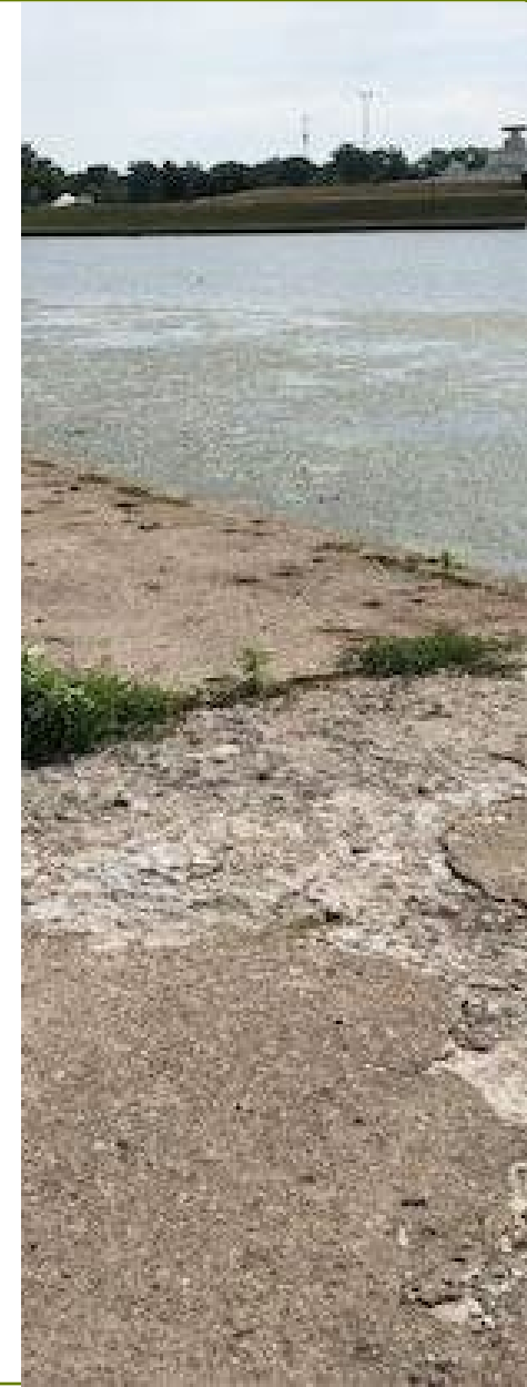
Existing Conditions of James Scott Memorial Fountain