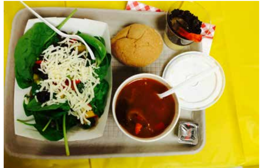
Community dinner from Waterford Schools Food Service, featuring local ingredients