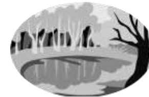
Nonpoint Source Control and Stormwater