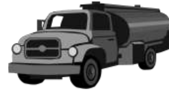
Septage Acceptance/ Treatment Facilities