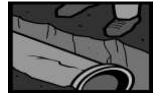
Interceptor/ Collection Systems