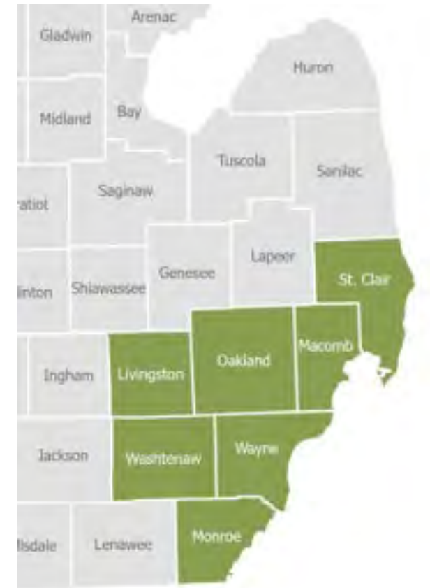
Southeast 2015 Ozone Maintenance Area