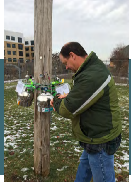
Man conducting air quality sampling

The Michigan Department of Environment, Great Lakes and Energy (EGLE) is doing air quality sampling in or near your neighborhood in the next few weeks. You may see EGLE staff putting out or taking down devices we use to collect the samples. More information about this sampling as well as additional information and all documents mentioned below are available at Michigan.gov/EGLECenturion .