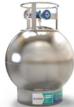
Summa canister used for sampling

The device will collect air over a 24-hour period sometime in the next few weeks. The air samples and their results take time to complete. We expect results to be ready to share in early Summer 2021. Once complete, the results of the sampling will be available at Michigan.gov/EGLECenturion .