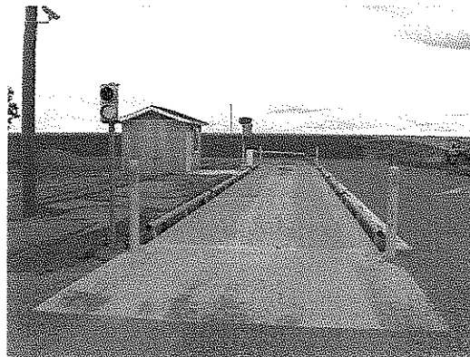
Figure 2 - Hauled Waste Scales

Once the readout on the scales has stabilized, the driver needs to scan the RFID card by waving it in front of the proximity card reader. The driver must indicate the product type of waste by keypad. The product types of wastes are “septage,” “grease,” “mixed” (i.e., septage mixed with not more than 25% of either food establishment septage or bakery oils and greases of animal or vegetable nature), or “other.” The requirement to indicate the product type may be eliminated if the hauler always carries the same product type and the card is coded for that product by the MCWMS. An initial weigh scale ticket will be generated by the weigh scale console for the driver. The driver may then proceed to the applicable hauled waste off-loading site once the arm of the traffic gate is up.