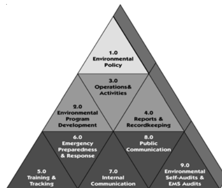
The C3 EMS Pyramid

In the left column of each page look for “Keys to citations of laws and regulations, and highlights and helpful hints to assist you with establishing and implementing your EMS.”