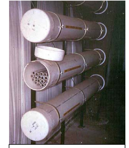
Example of one type of universal waste storage. End cap removed for taking picture.