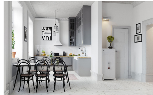
Ducted thru-the-wall kitchen exhaust fan takes moist air and fumes outside the home.

Data adapted from the 2015 MEC and 2021 IECC. Exceptions may apply. See source documents for complete details.