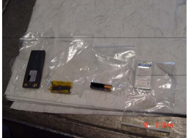
(Individually packaged batteries to prevent short circuits)

All batteries must be packaged for transportation in a manner that prevents short circuiting and damage to the battery or its terminals. This may be achieved by packing each battery in fully enclosed inner packagings made of non conductive material or separating the batteries from each other and other conductive material in the same package and pack to prevent damage and shifting while in transport.