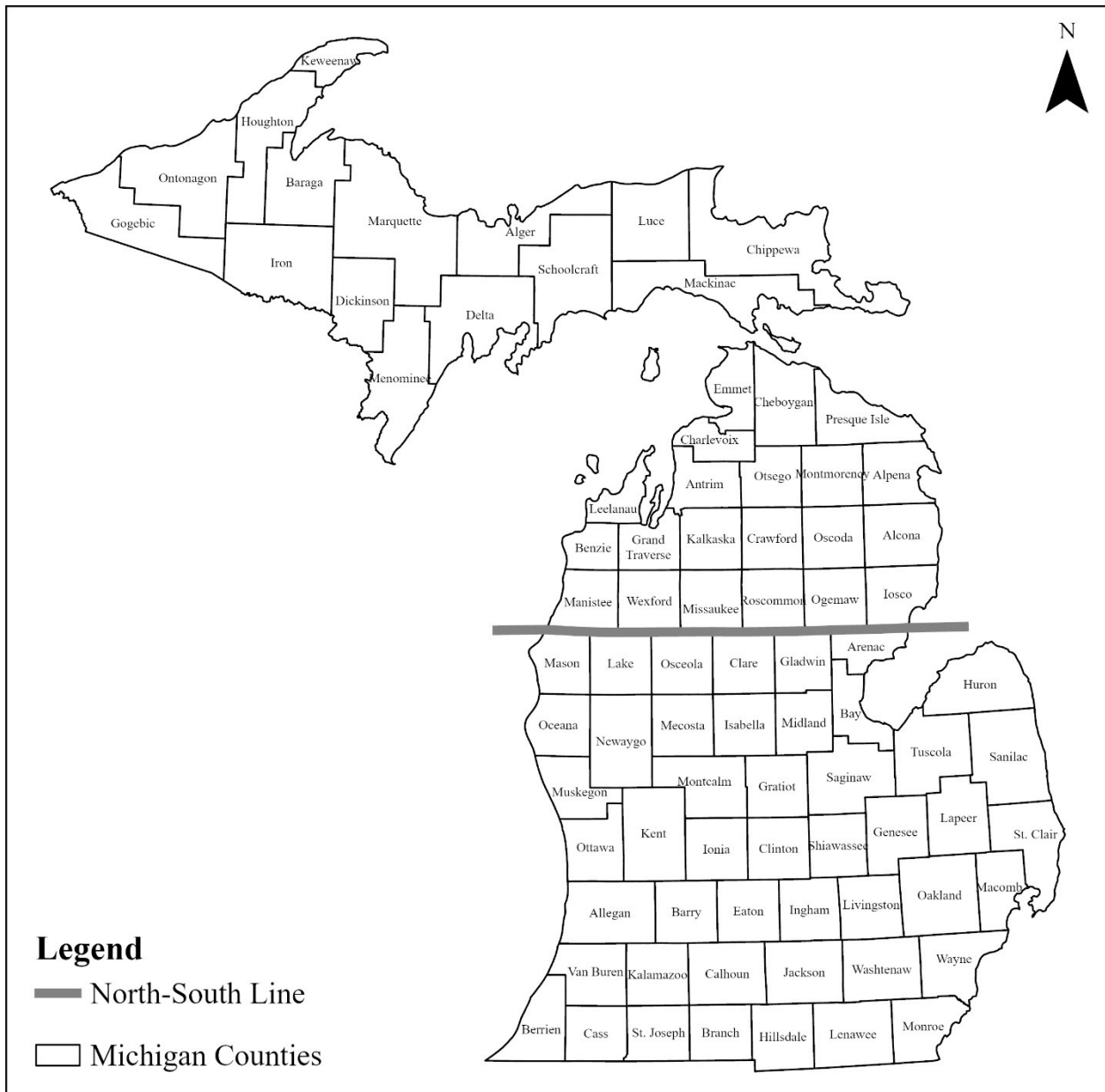
Figure 1. Map of Michigan divided into copper-use restriction regions by a gray line. Copper-use is restricted to chelated copper products from May 15 to July 14 in waterbodies north of Mason, Lake, Osceola, Clare, Gladwin, and Arenac counties. Copper-use is restricted to chelated copper products from May 1 to June 30 in waterbodies within and south of Mason, Lake, Osceola, Clare, Gladwin, and Arenac counties.

Due to the toxicity of copper to spawning fish, do not apply copper products within 20 feet of a known, or suspected, active spawning bed.