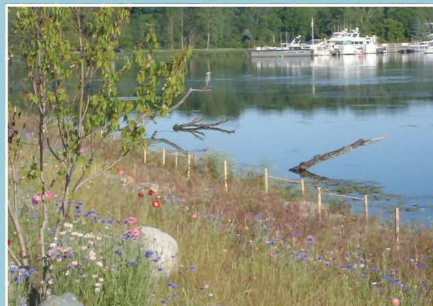
Native plants flourish following completion of the White Lake shoreline habitat restoration project.

- Jeff Auch, Muskegon Conservation District